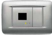
Infrared Receiver w/Remote

With the programmable infrared multi-function remote control you can manage functions.