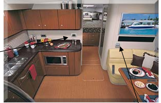
Automation Control Panel

This is the heart of the system, all functions are managed and programmed from here by navigating through the display in a straight forward user-friendly manner.