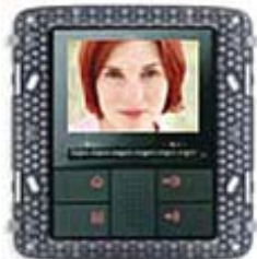
Video Door Entry Unit

Access To the Control System – can be accomplished through multiple technologies; biometrics, smart cards, phone, switches, infrared remote, voice or motion sensors among others.